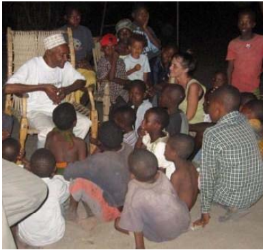
Babu telling stories

On Christmas day 2007 we officially opened the Baby Home!! We had a party in the morning at the breakfast program with