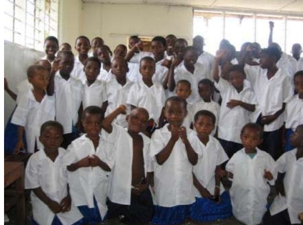
The Breakfast Program kids in their new uniforms

Please consider making a donation to the new breakfast program as we make it bigger and stronger!